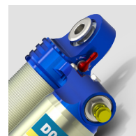
High & Low Speed Compression Damping and Hydraulic bump stop damping