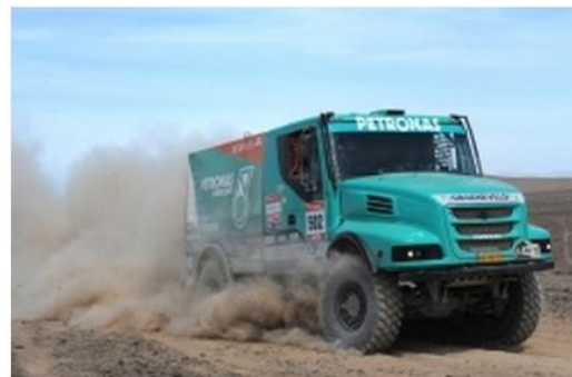
/// Gerard DE ROOY -

----- Find our corresponding article here : http://www.donerre.fr/actualites.article.php?langue=en&id=200