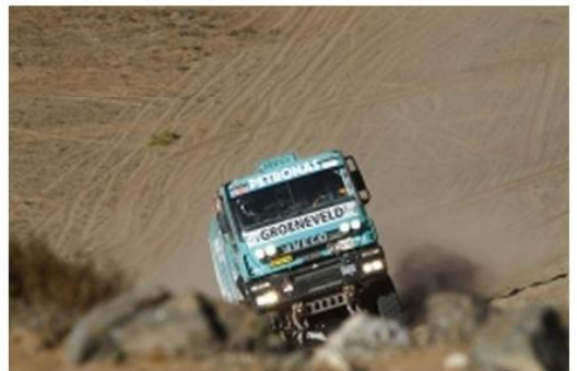
/// Pep VILA -